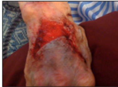
Type 2: Partial Flap Loss

Partial Flap loss which cannot be repositioned to cover the wound bed