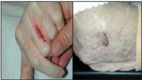
Type 1: No Skin Loss

Linear or Flap Tear which can be repositioned to cover the wound bed