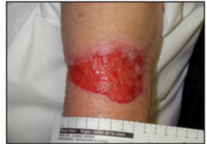
Type 3: Total Flap Loss

Total Flap loss exposing the entire wound bed